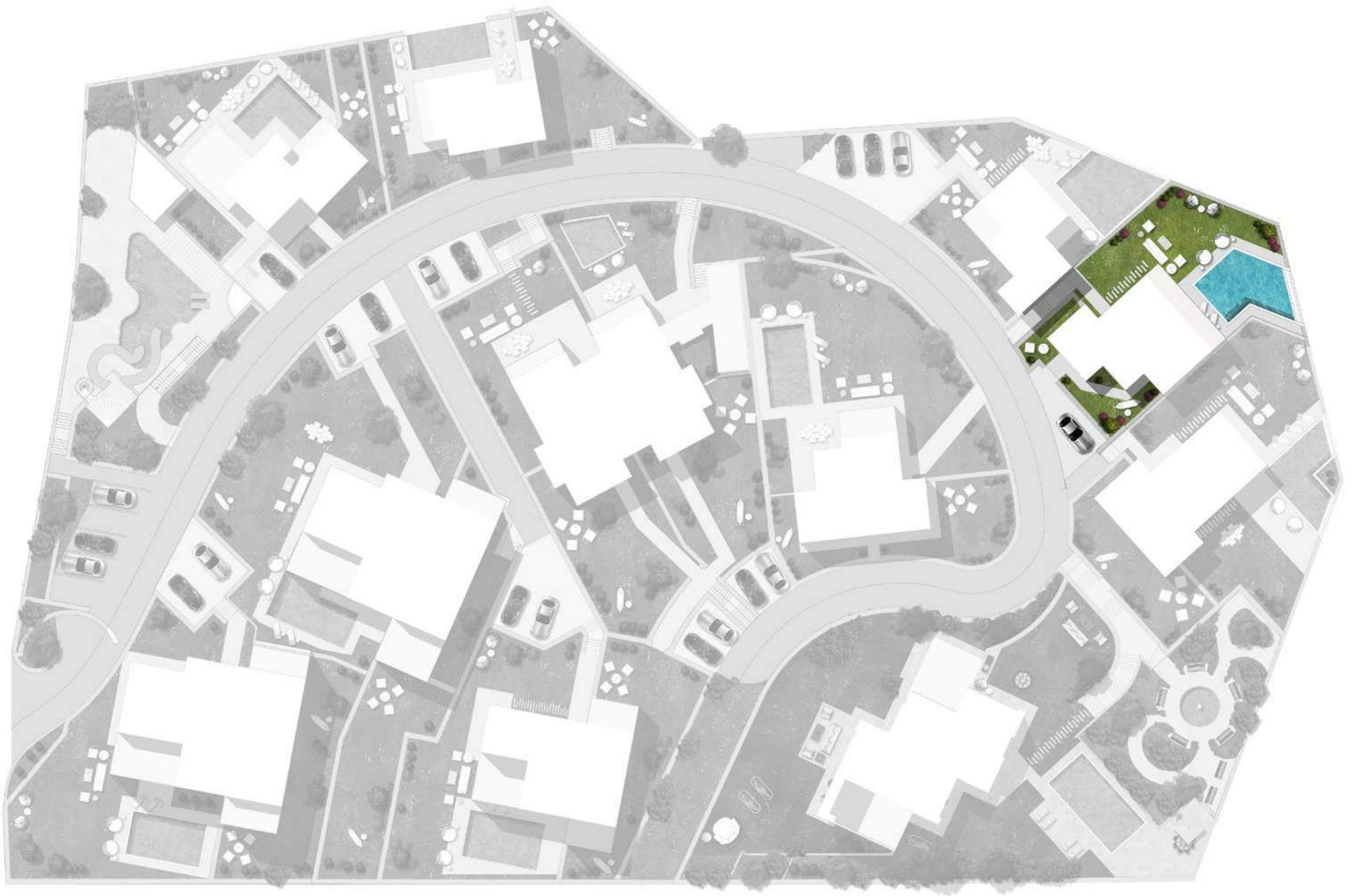
VILLA MARIGOLD LOCATION