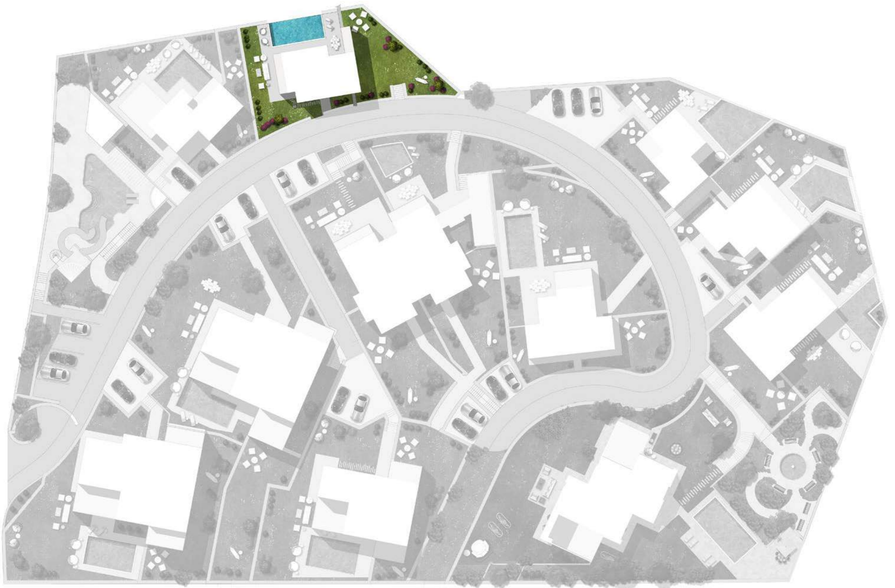
VILLA CARNATION LOCATION