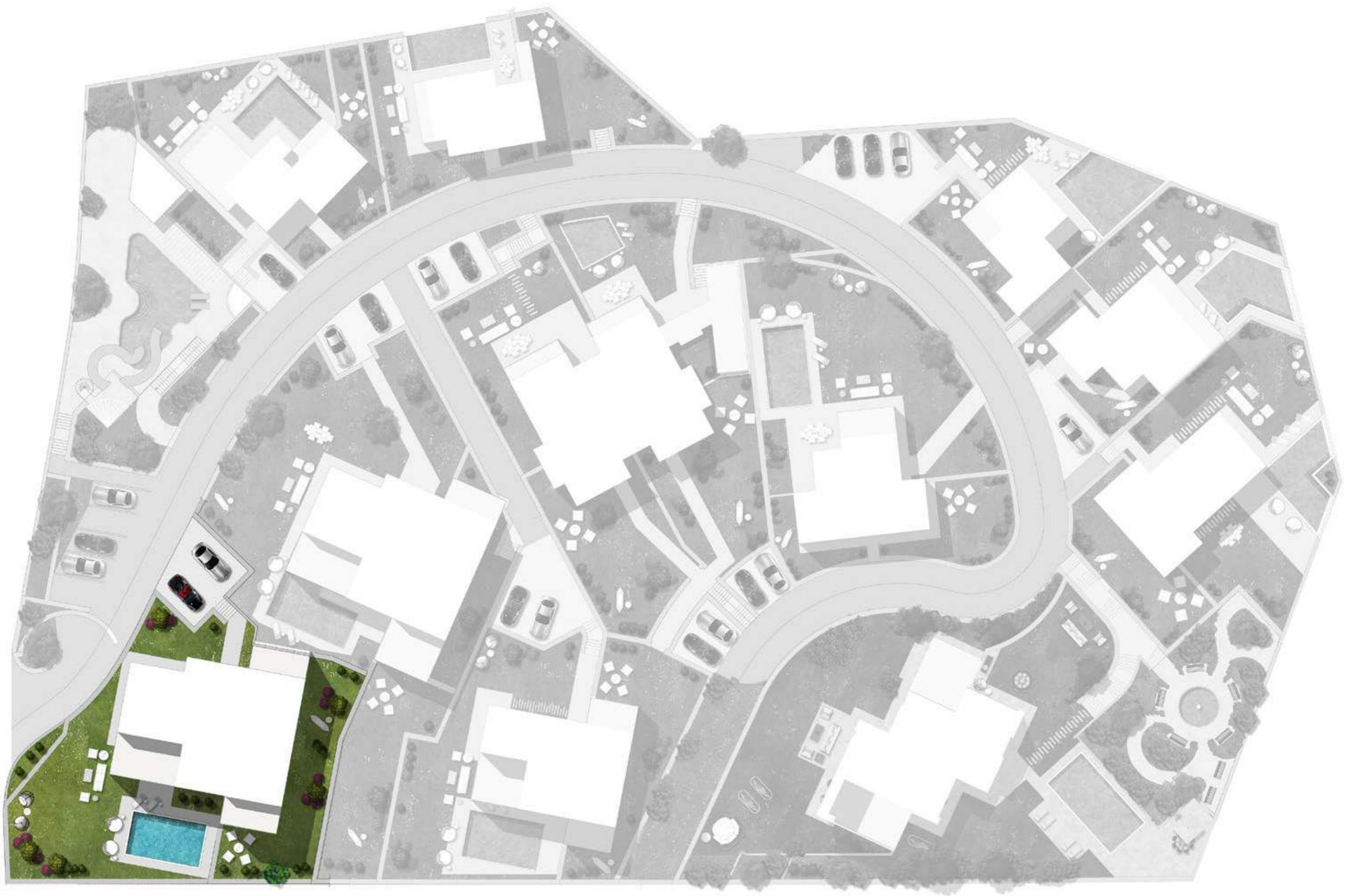
VILLA FREESIA LOCATION