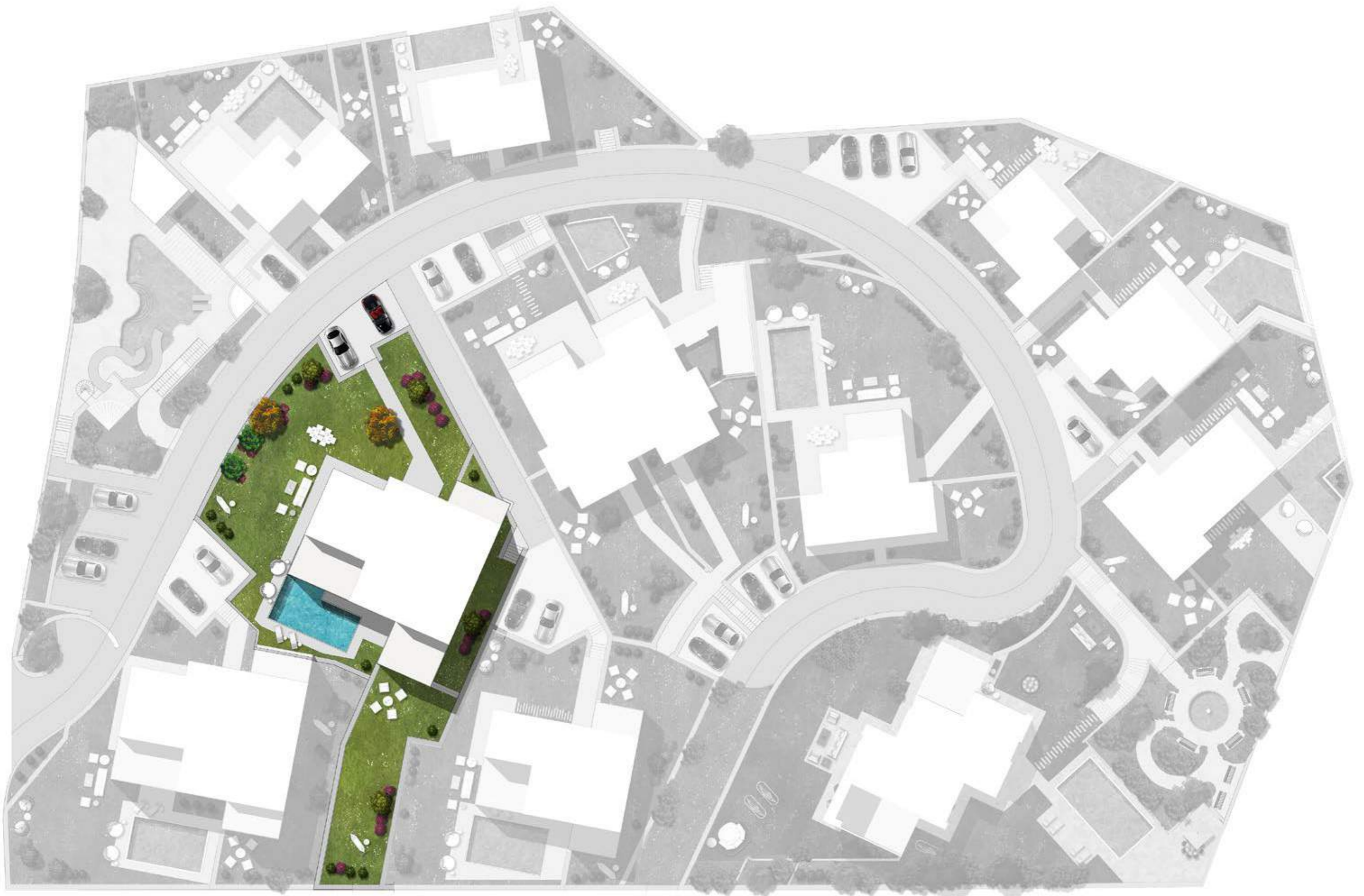
VILLA TULIP LOCATION