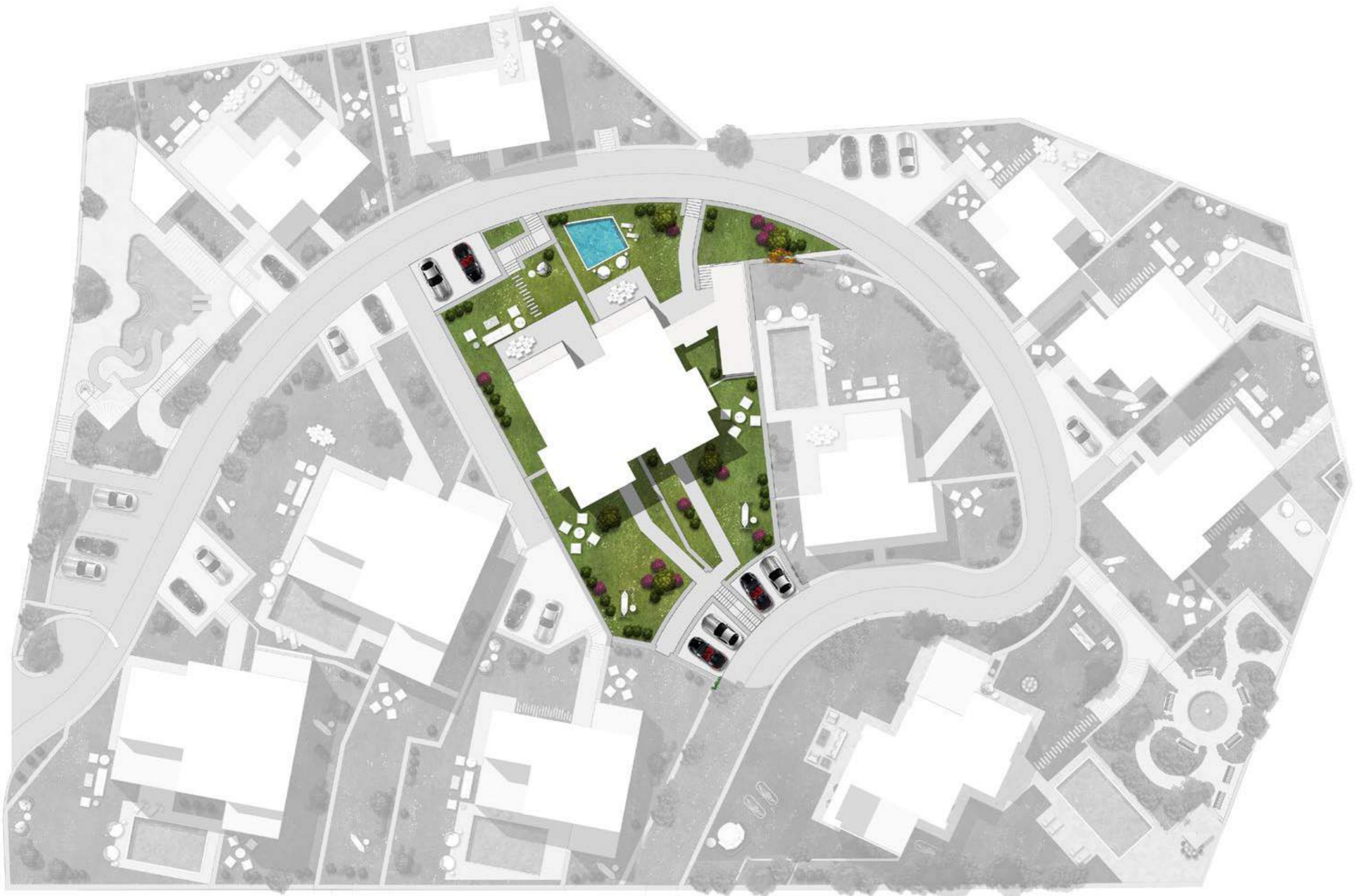
VILLA PEONY & VILLA POPPY LOCATION