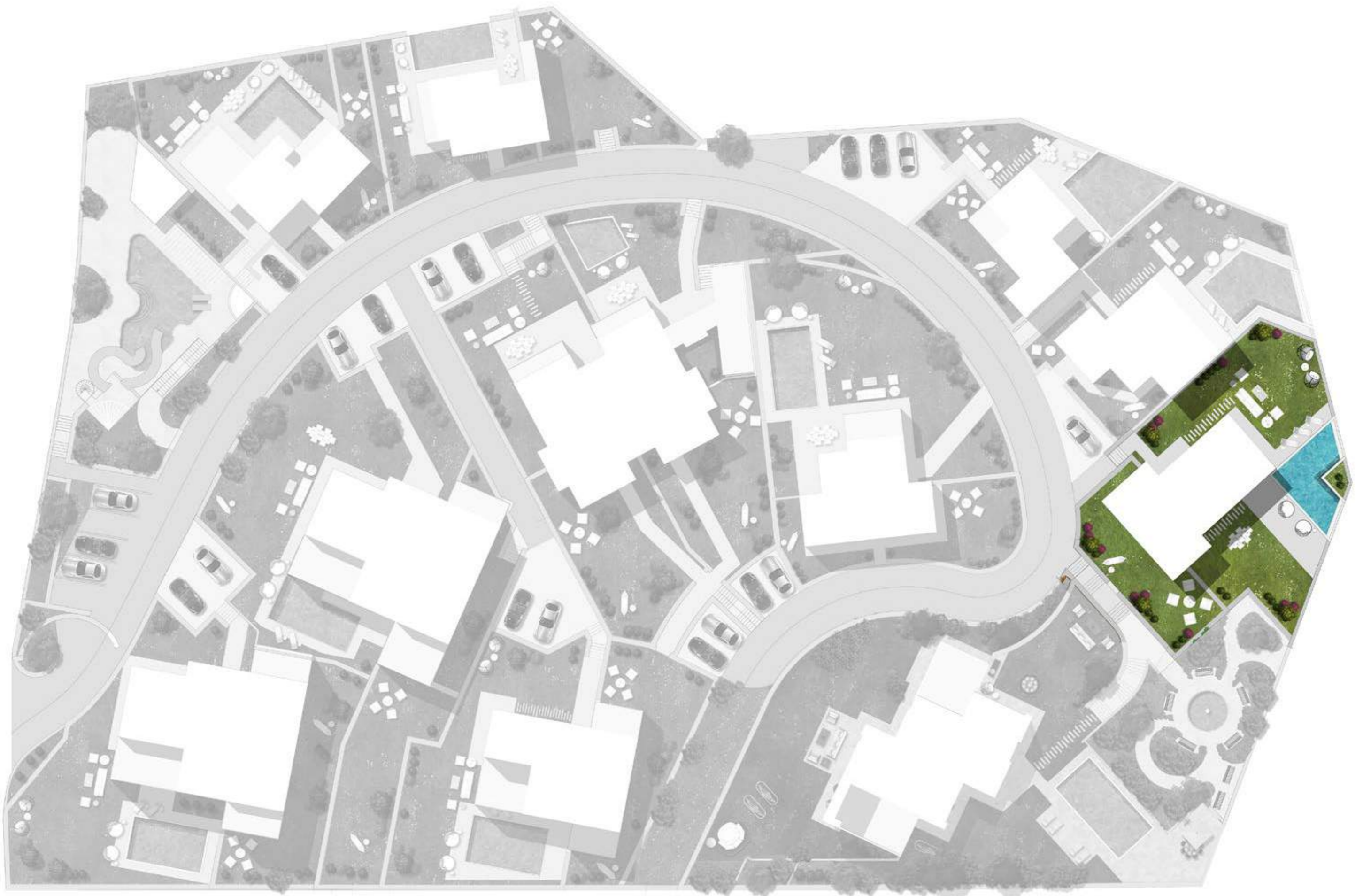
VILLA ORCHID LOCATION