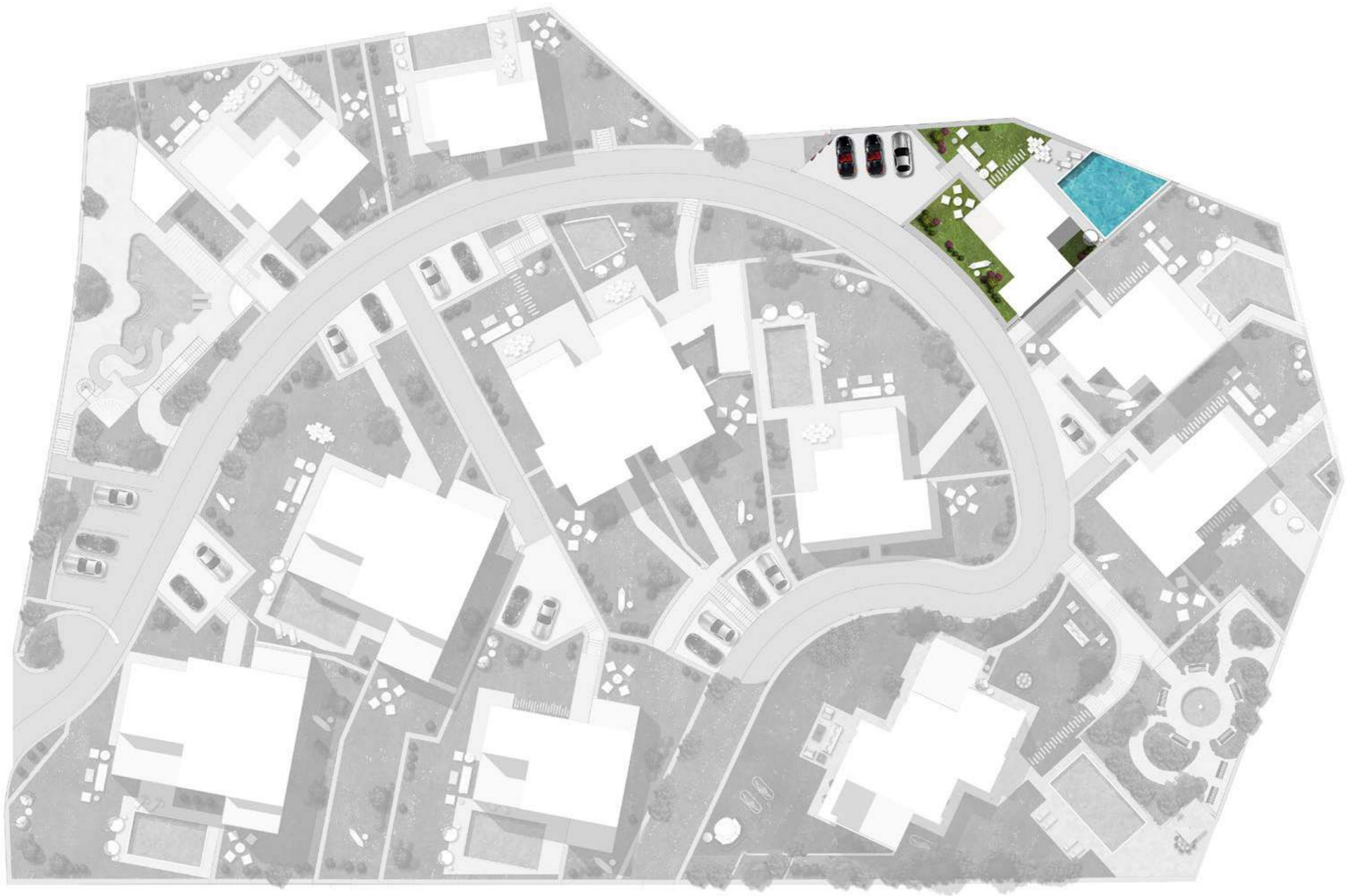
VILLA GARDENIA LOCATION