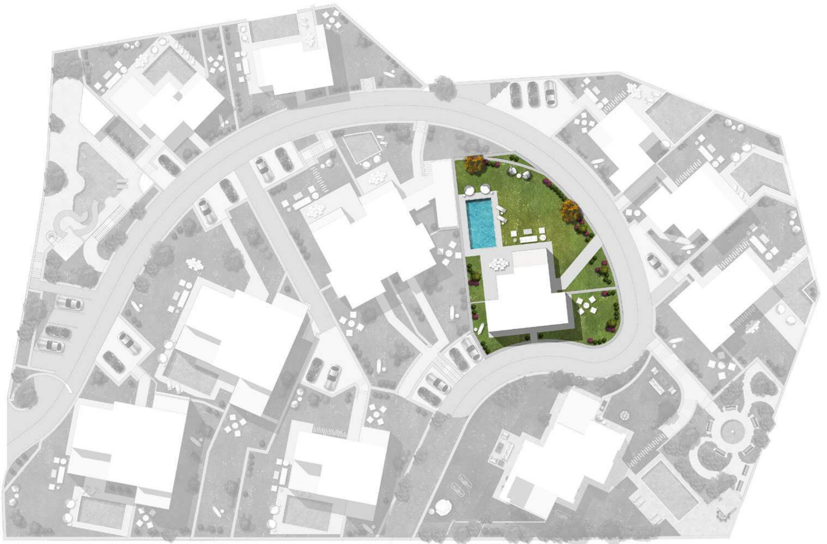
VILLA LILY LOCATION