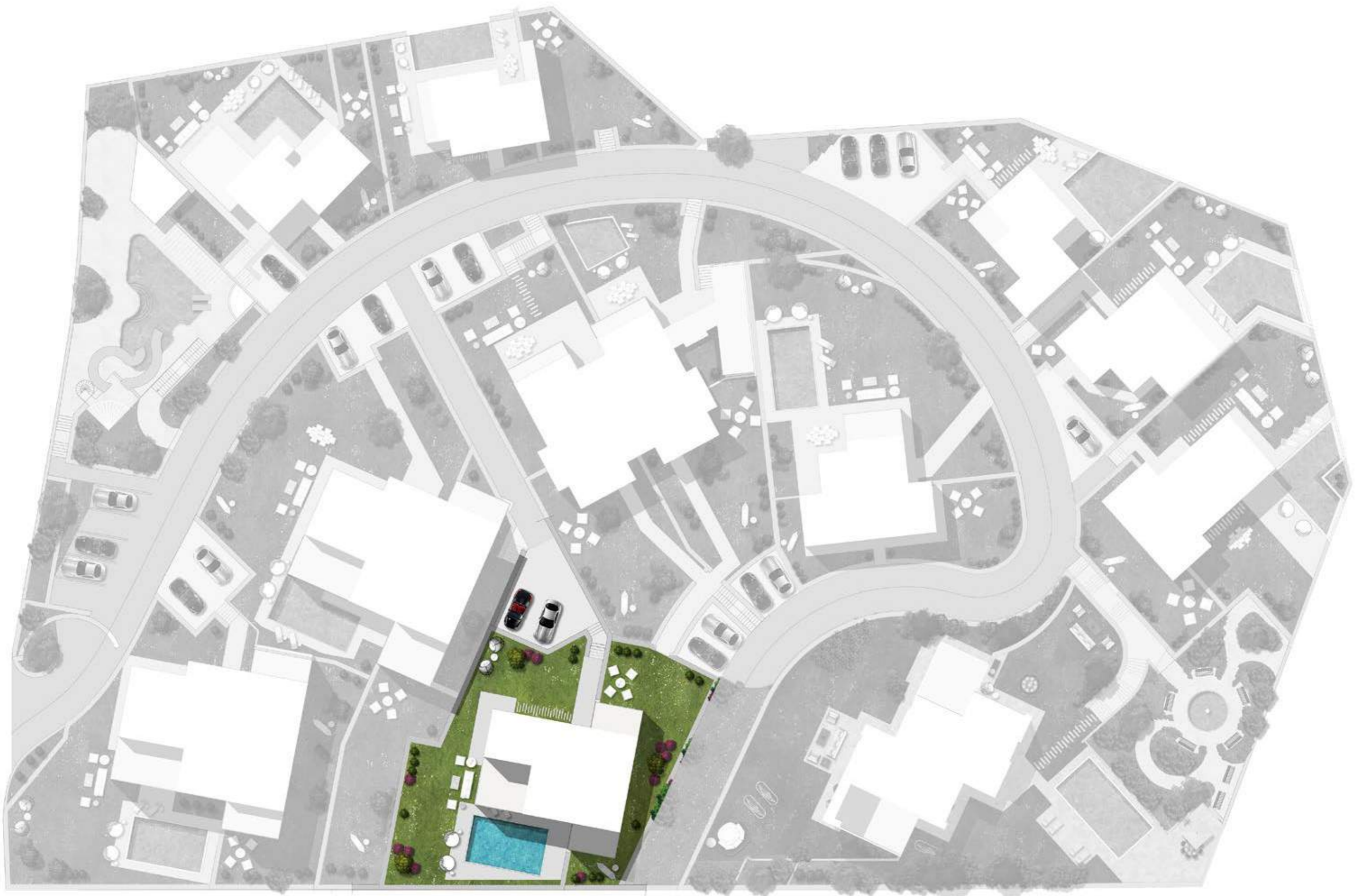
VILLA LOTUS LOCATION