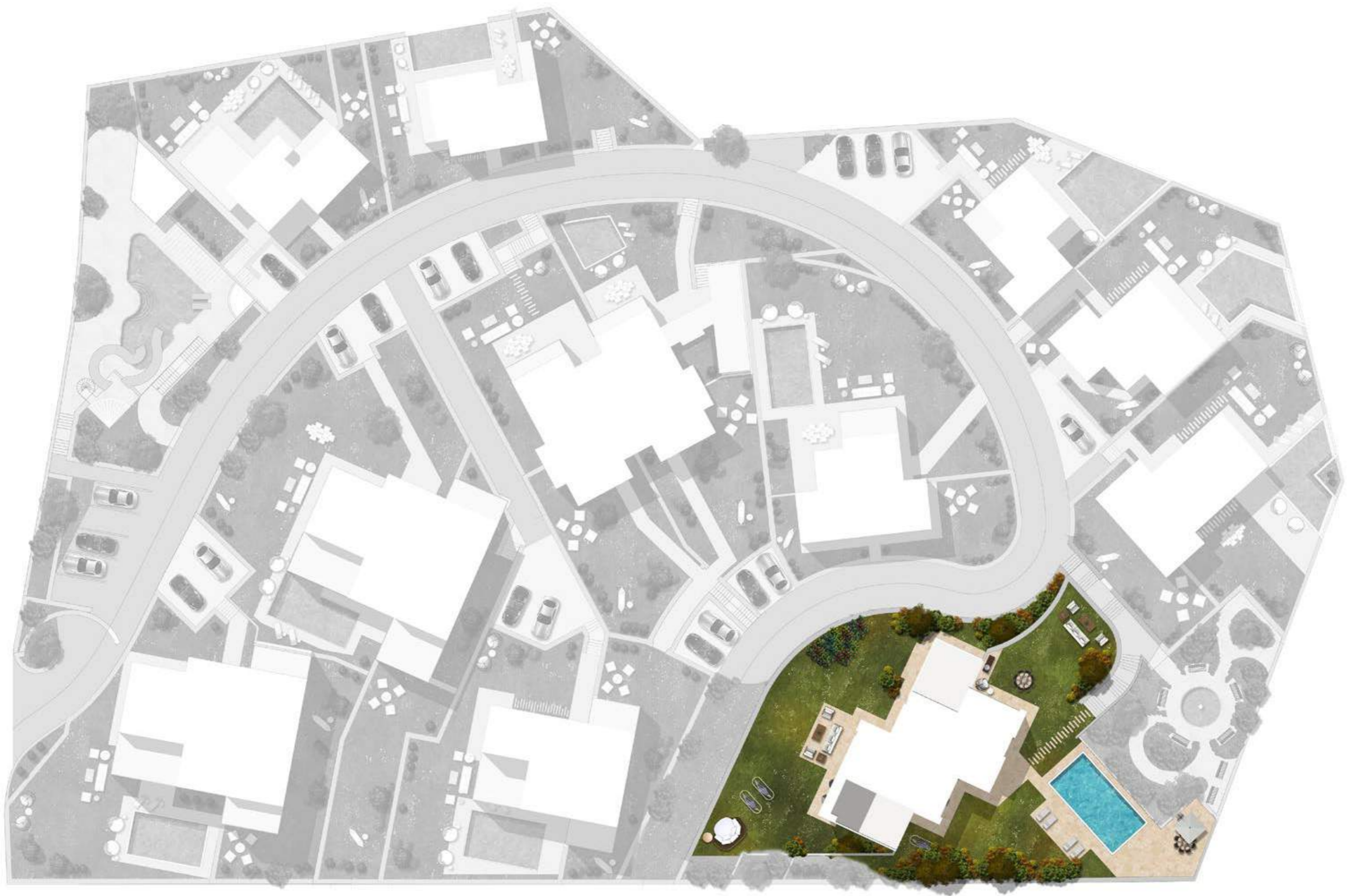
VILLA ROSE LOCATION