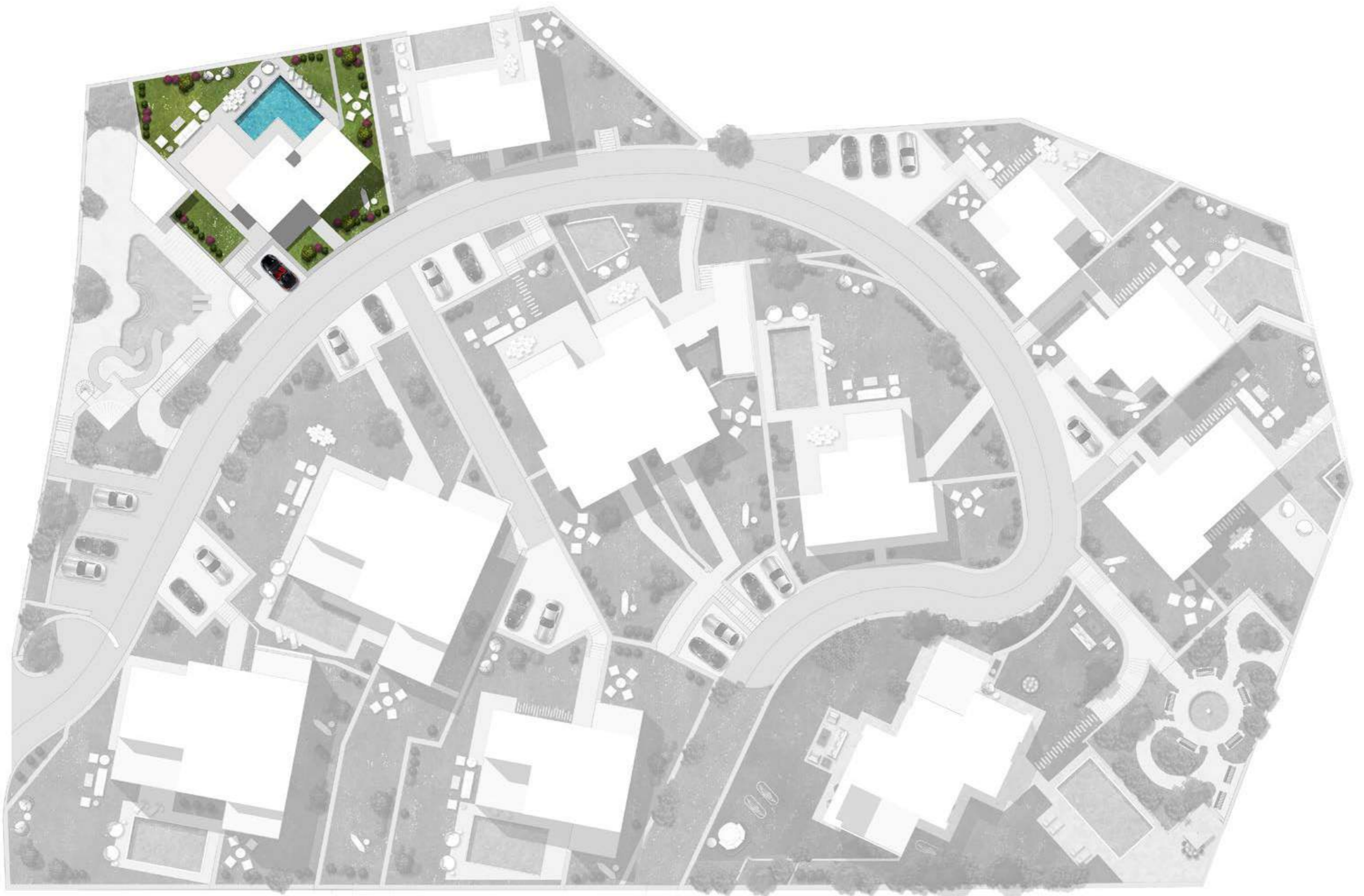
VILLA DAHLIA LOCATION